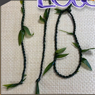
Ti Leaf Leis • $10 each Symbolizes positive blessings, protection from evil elements, prosperity and luck. One of the most valued and common Hawaiian leis.

Orders must be placed and paid with a minimum of 3 business days (please refer to the Arts & Crafts hours of operation).