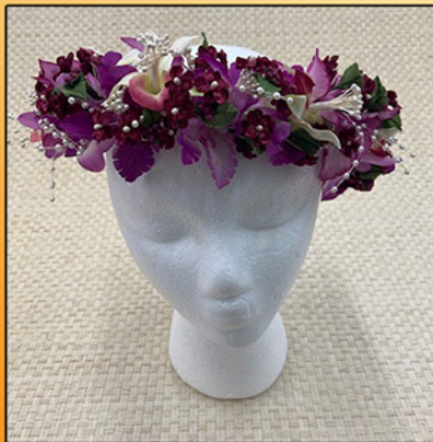
Lei Po'o Orchids & Beads • $25 (Head Lei) Artificial flowers *general head size measurement is required*