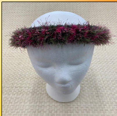
Lei Po'o Crochet Roses • $25 (Head Lei) Artificial flowers *general head size measurement is required*