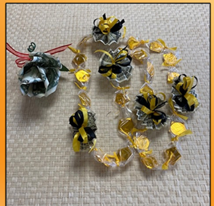
Money Lei with Coins • $25

Single Rose: (with 5 wrinkle-free bills) $10 (with 3 wrinkle-free bills) $5