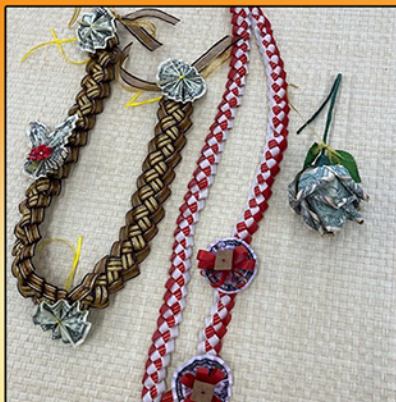
Money Lei • $25 Additional fees:

Circular money flowers (1 wrinkle-free bill): $1 each for mounting and creating flower.