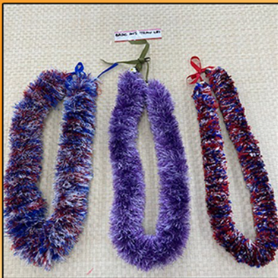
Eyelash or Feathered Yarn Leis 2 colors - $15 3 colors - $18

All fees includes all supplies with the exception of bills (must be wrinkle-free)