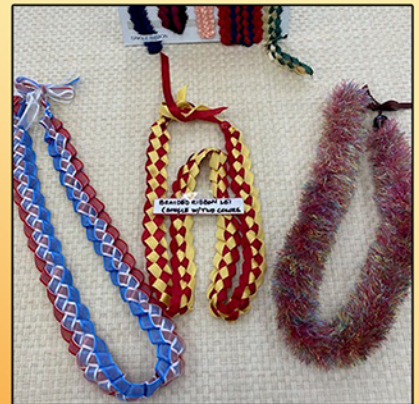
Ribbon Leis 2 colors - $15 3 colors - $18